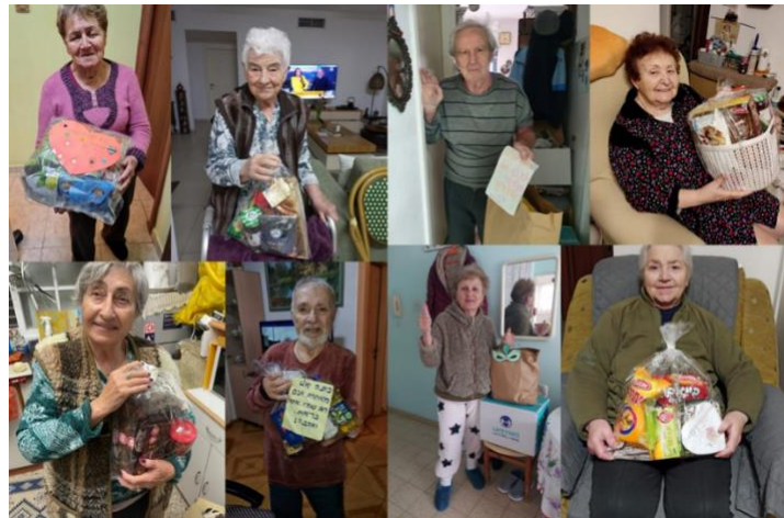
Pictured: Survivors receiving Purim baskets made and delivered by our volunteers

To celebrate every holiday and make it a special one for the survivors, Latet always finds a way to mark the occasion. On Tu B'Shvat, survivors received a plant from volunteers, survivors attended a Chanukah candle lighting ceremony, and on Purim, survivors received cakes from volunteers. Together with volunteers, Latet staff and various institutions, we were able to mark every holiday by making it truly special, all while relieving the loneliness of survivors-all year long.